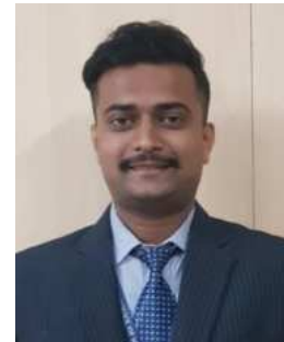
Contributed by : Akshay Kale Ist Year MBA Student

Out of its previous investments, 20 per cent have given high returns and 50 per cent averaged out while 30 per cent were written off. Food and retail have been the sector where Franchise India invested the most.